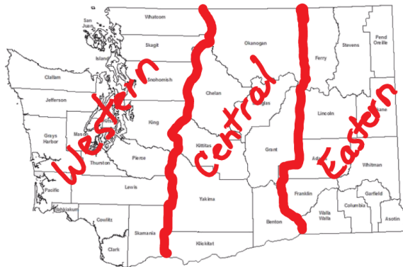
POSSIBLE WSBEA AREA REP. CONFIGURATION